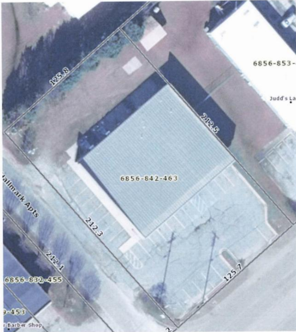
Greenwood PTC- Wellness Center