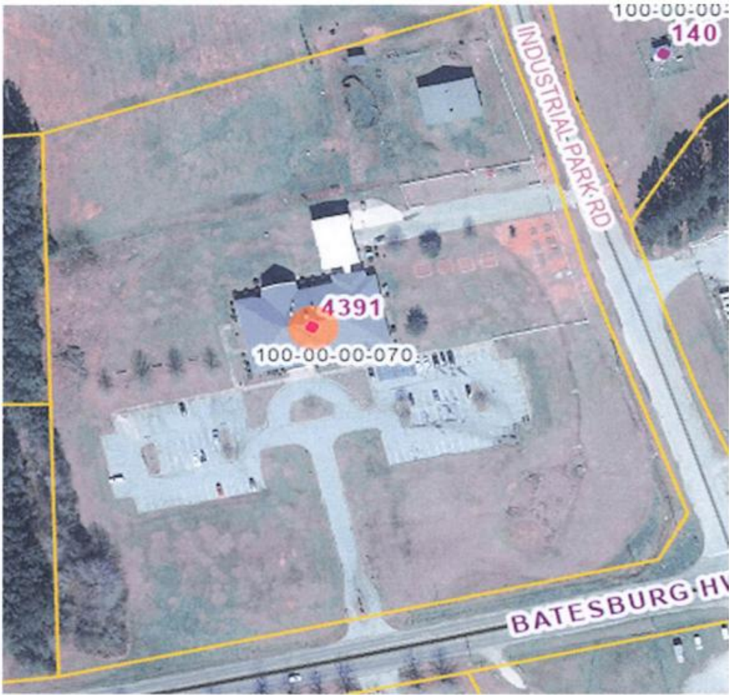
Saluda County Campus