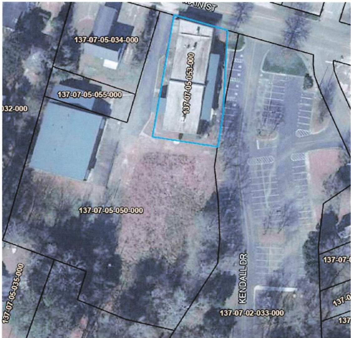
Edgefield County Campus