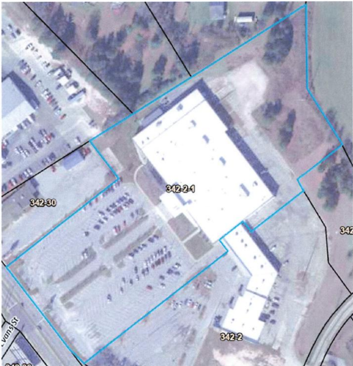
Newberry County Campus