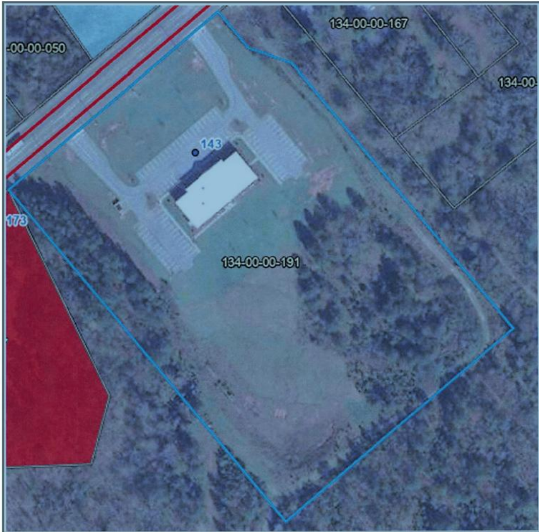
Abbeville County Campus