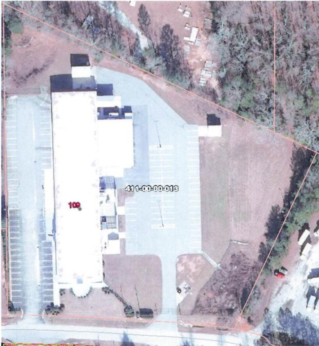
LCAM- Laurens Center for Advance Manufacturing